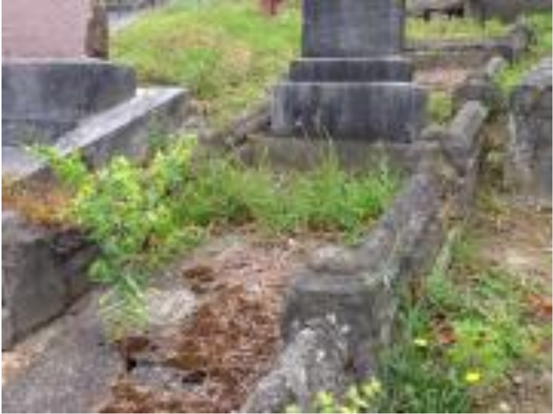
ABOVE: NEARBY GRAVES